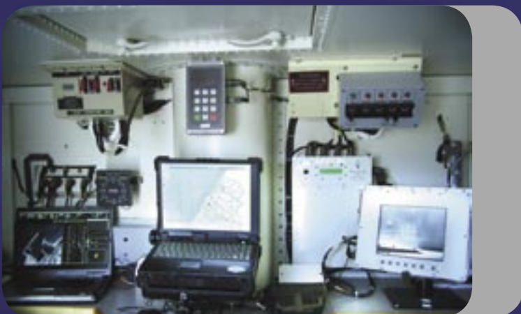
DSIT's PortView™ Harbor Surveillance System (HSS)

DSIT's PortView™ Harbor Surveillance System (HSS) incorporates the AquaShield™ DDS, search radars, and Day/Night thermal cameras into a comprehensive above and below water Command & Control security system.